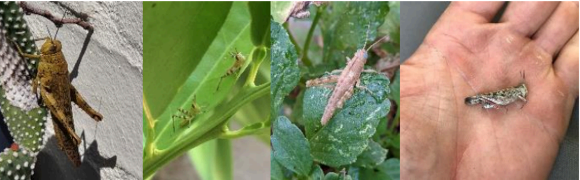
Photos left to right: Adult Valanga irregularis , juvenile Valanga irregularis (second & third image), adult Australian plague locust.

Did you know that all locusts are grasshoppers...but not all grasshoppers are locusts? Grasshoppers and locusts are part of the order Orthoptera, meaning 'straight-winged'. Grasshoppers are plant-eating insects with long hind legs, specialised for jumping and producing their well-known 'chirping' sound. The term 'locust' simply refers to grasshoppers which can breed and feed within large groups (swarms) and cause extensive damage to surrounding vegetation.