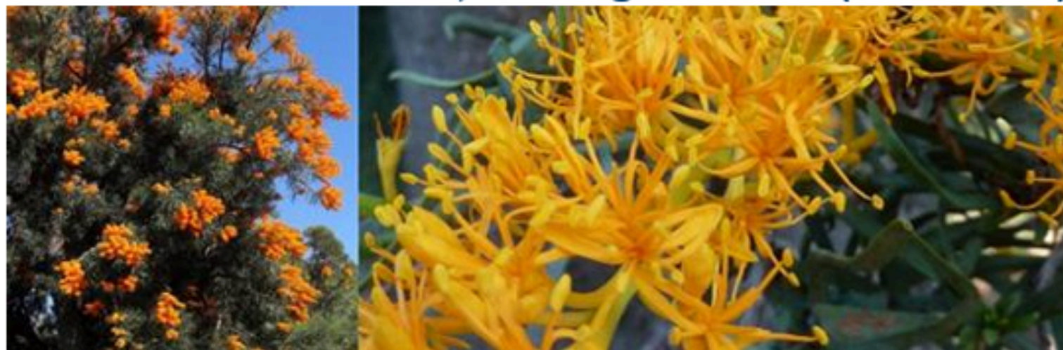
A Nuytsia floribunda flowering in Perth bushland, a close view of the characteristic golden yellow blooms.

Christmas is just around the corner, and that means the glorious Western Australian Christmas tree, or moodjar in Noongar ( Nuytsia floribunda ), are in bloom! Not only are they our state's most iconic summer-flowering tree, but they're one of the botanical world's most fascinating survivalists!