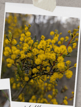
Wattles Acacia sp.