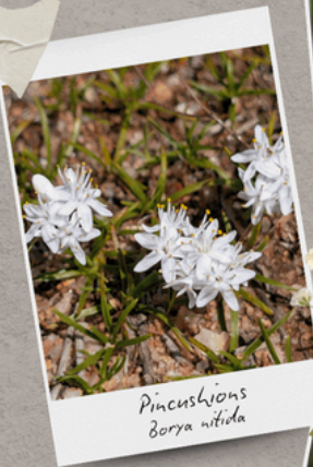
Pincushions Borya nitida