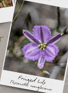
Fringed Lily Thysanotus manglesianus