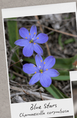
Blue Stars Chamaecilla corymbosa