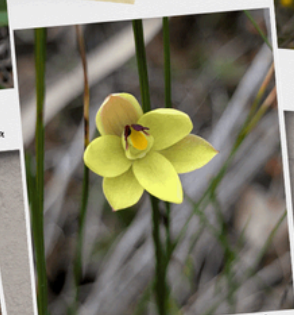
Lemon Scented sun orchid Thelmitra antennifera