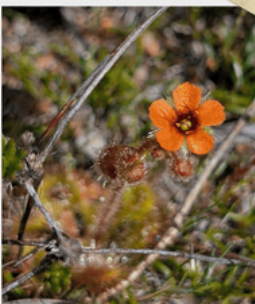
Pimpernel sundew Drosera glanduligera