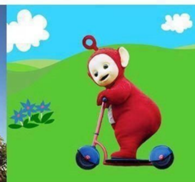
How you actually look