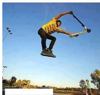
How you think you look