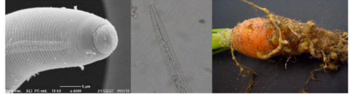
From left to right: Juvenile pratylenchus x 4000 magnification, Sting nematode head region, carrot with root knot nematode.