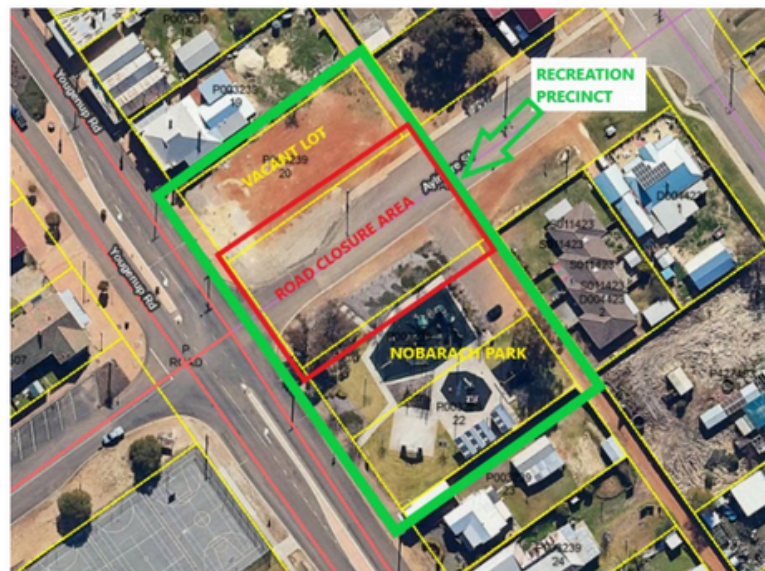
Attachment 2 - Alternative vehicle access options