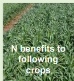
N benefits to following crops

ALOSCA granules provide flexibility like no other inoculant.