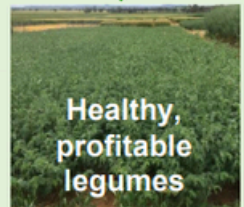
Healthy, profitable legumes