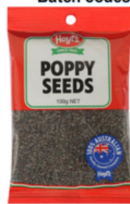
100g Sachet Packet

Batch codes: 28622, 29322, 29822 & 29922