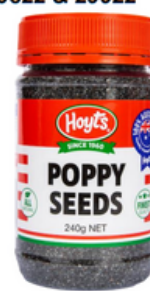
240g PET Jar

Hoyts Food Manufacturing Pty Ltd is conducting a recall of the above products. The products have been available for sale at Coles & Woolworths nationally.