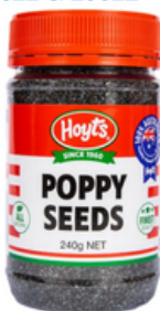
240g PET Jar

Hoyts Food Manufacturing Pty Ltd is conducting a recall of the above products. The products have been available for sale at Coles & Woolworths nationally.