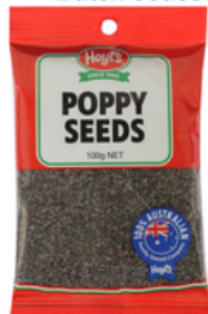
100g Sachet Packet

Batch codes: 28622, 29322, 29822 & 29922