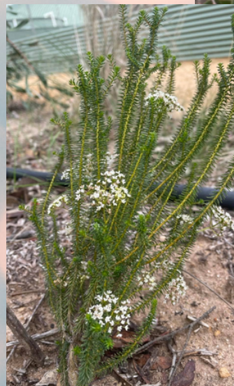
Ravensthorpe radish or youlk