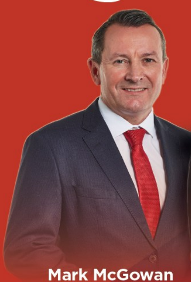
Mark McGowan Premier of Western Australia MarkMcGowanMLA