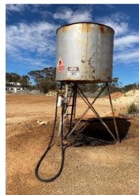
TANK 1 (2000L)

The highest bidder may not necessarily be accepted.