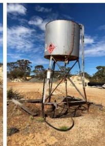
TANK 2 (2000L)