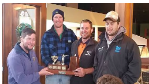
Winning team the "Corackerup Killers"