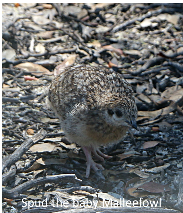
Spud the baby Malleefowl